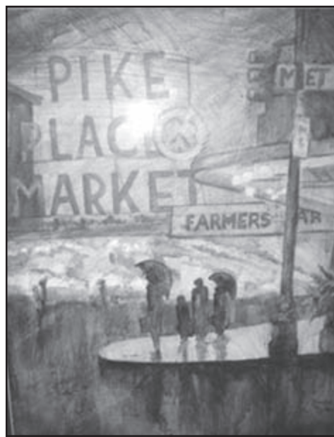
Nancy Rothwell's water color finished a strong third.